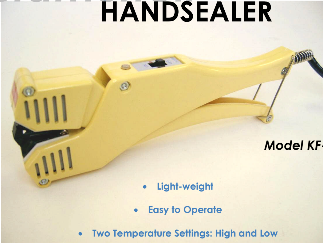
Model KF- 772DH